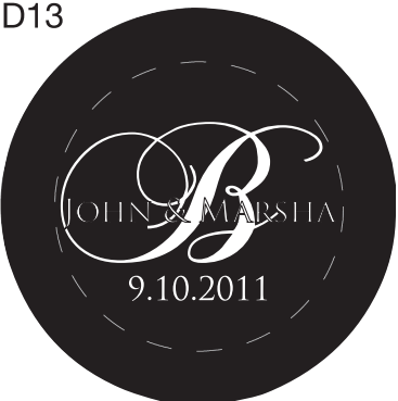
KB Chopin Script, Trajan Pro