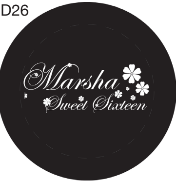
Easy street EPS