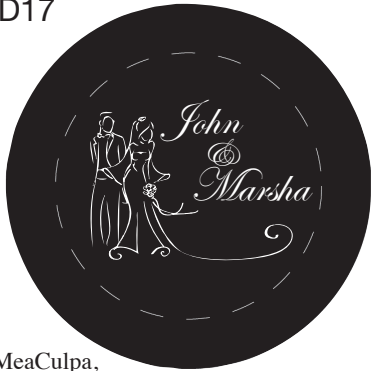
MeaCulpa, Trajan pro