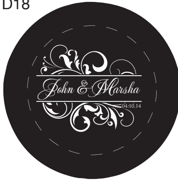
Edwardian Script ITC