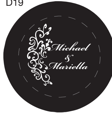
Brickham script pro