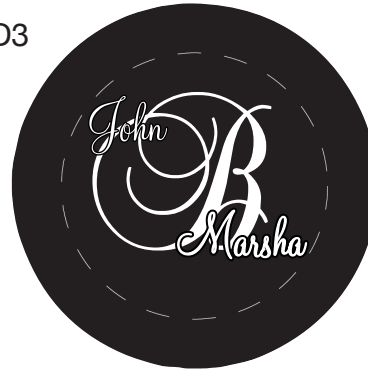
Baroque Script & Monterey BT