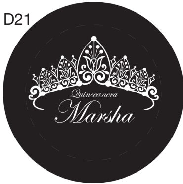
Edwardian Script ITC