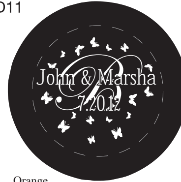
Orange, Edwardian Script ITC