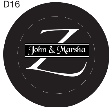
Black Chancery, Zapfino