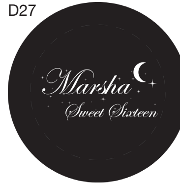
Edwardian Script ITC