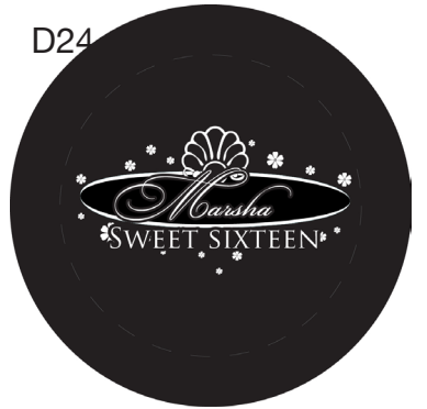
Brickham Script Fancy 2 & Trajan Pro