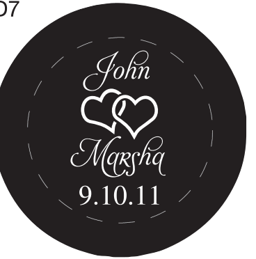
Aphrodite Contextual & Times