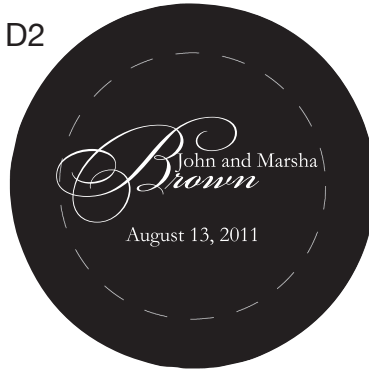
BickhamScript Fancy2/BickhamScript & Garamond Pro