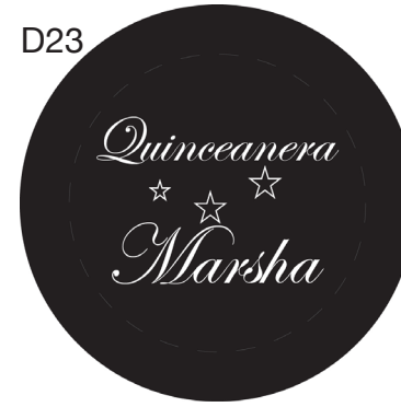
Edwardian Script ITC