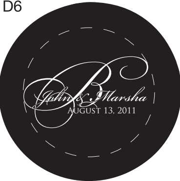
BickhamScript Fancy, BickhamScript, TrajanPro