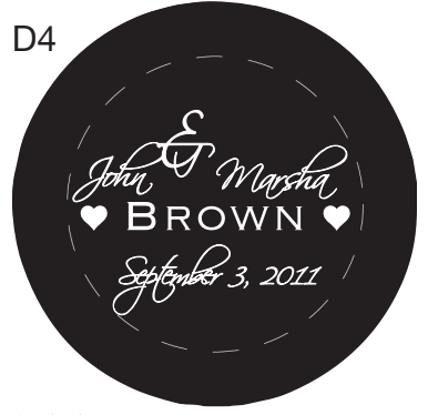
Scriptina & Trajan Pro