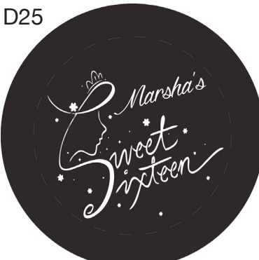
Dragon is coming