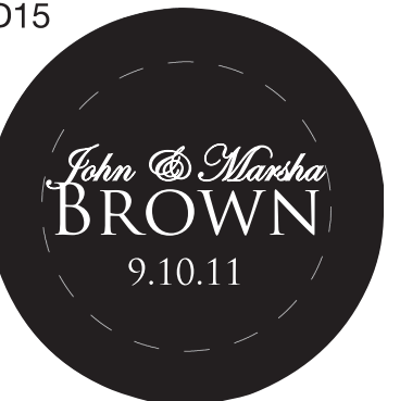
Edwardian Script, Trajan Pro