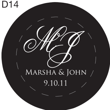
Old Script, Trajan Pro